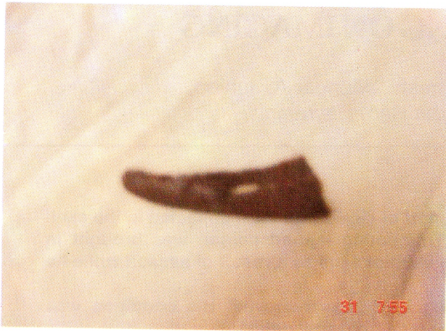
Figure-III: Foreign body is seen in right parietal region.