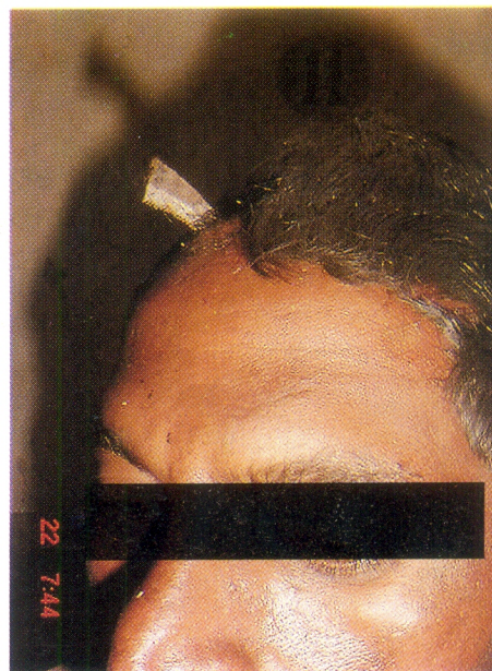
Figure-I: Foreign Body inside the skull

was penetrating the dura. Durameter was washed and repaired with silk 2/0. After doing other steps the wound was closed in layers. The patient was discharged after ten days without any neurological symptoms / deficit. The CT Scan was done on last day and patient returned home. After two days, he returned with history of fits, weakness and pain in left sided limbs. He stayed for another week in the ward, where complaints of left sided upper and lower limbs were recovered. Patient was then discharged on his wish still with the complaint of fits off and on.