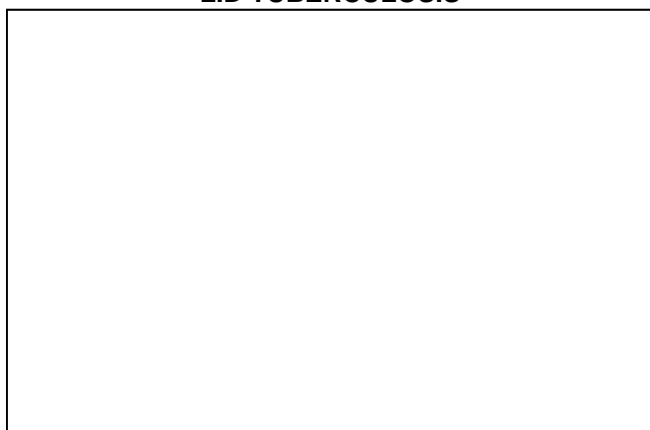
FIGURE IV: RIGHT EYE ISOLATED EYE LID TUBERCULOSIS (AFTER TREATMENT)