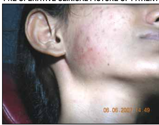
FIGURE I: PRE OPERATIVE CLINICAL PICTURE OF PATIENT

thesia. The wound was sutured with 3-0 silk and dressing was done. Patient was advised for antibiotic therapy and follow up after one week ( Figure II ). Postoperative findings revealed a hard mass with an irregular surface, carrying attached portion of overlying skin. Microscopic description revealed fibrocollagenous tissue showing a nodular lesion exhibiting nests of basophilic cells with few areas showing ghost appearing cells. The nuclei were round to oval. Intervening stroma was fibrocollagenous and in areas showing giant cell reaction. Osseous metaplasia was also identified. Focally skin tissue was identified on the surface. No evidence of any cyst formation or malignancy was seen ( Figures III-IV ).