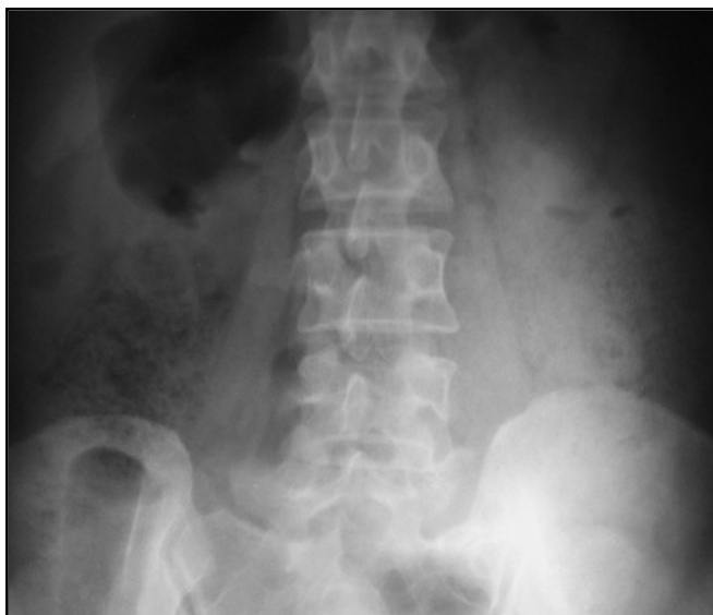
FIGURE III: PER-OPERATIVE RETRIEVAL OF SPONGE