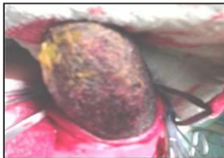
FIGURE II: PHOTOGRAPH SHOWING TRICHOBEZOAR BEING EXTRACTED DURING FIRST LAPAROTOMY