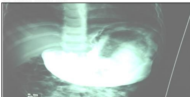
FIGURE I: BARIUM MEAL IMAGE SHOWING FILLING DEFECT

Blood Investigations; Serum electrolytes, urea, creatinine, amylase and liver function tests were within normal limits, while complete blood count showed low hemoglobin level and slightly raised total leukocytes count. X-ray abdomen erect posture was insignificant with few calcifications in left hypochondria. Ultrasonography revealed a 10 cm echogenic mass casting posterior acoustic shadow seen within bowel loops in epigastric region with calcifications. Barium study showed a large filling defect in stomach suggestive of trichobezoar ( Fig I ). After blood transfusion, surgery was planned and gastrotomy did, a long trichobezoar removed acquiring the shape of the stomach and extending up to the jejunum/ileum approximately length was around 70 cm ( Fig II ). Stomach was closed in two layers. Patient was discharged without any problem on 6th post-operative day. The Patient was referred to a psychiatrist for evaluation and treatment. After surgery, he consulted me up to two months then having no communication.