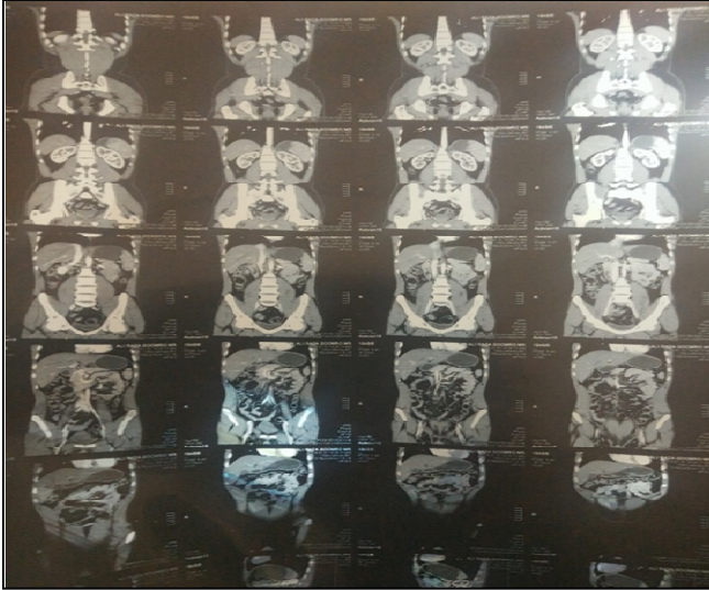
FIGURE IV: CT SCAN ABDOMEN

Diagnosis: Stomach polyp; well differentiated neuroendocrine neoplasm grade I.