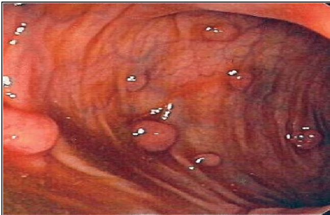
FIGURE I: UPPER GI ENDOSCOPY SHOWING MULTIPLE SESSILE POLYPS

Blood CBC (Complete blood count) revealed; RBCs 4.54 mil/cumm, (HB level 12.8 g%, ESR 10 mm/hr, HCT 39.2%, MCV 82.2fl, MCH 29.6pg, MCHC 36.6g/dl). WBC 6500/cumm, (N=58, L=40, E=01, M=01, B=00). Platelets count was 250000/cumm. Liver chemistry was within normal limits (Billurubin Total=1.0 mg%, Billurubin direct=0.66mg%, Billurubin indirect=0.44mg%, SGPT=35.0 u/l, Alkaline Phosphatase=188.4u/l, g-GT=12.4u/l). Antibodies against H. pylori antigen were negative. Random Blood Sugar was 144.6mg/dl, serum Creatinine value was 1.0mg/dl, and blood urea level was 40/dl, sodium 135 meq/dl, potassium 4.0 meq/l, Chloride 112 mmol/l and HCo 3 24mmol/l. Prothrombin Time 12 Seconds, (Control=12seconds). Activated Prothrombin Time was 32 seconds, (control=32 seconds). Routine Viral markers were advised and checked all including HCV, HBV, and HIV were negative. MP ICT antigen was negative as a routine part of checkup. Urine D/R report Normal. Stool examination normal, negative for stool occult blood. Serum Gastrin level was 465pg/ml (normal 0-89pg/ml).